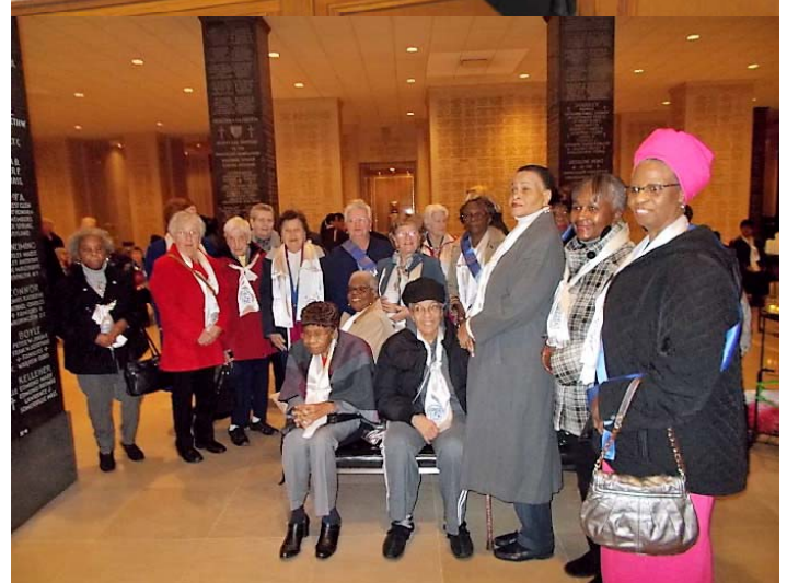
Pilgrimage to Emmitsburg