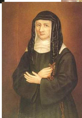
St. Louise De Marillac