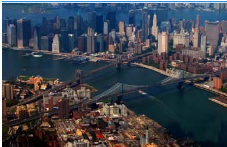
New York, New York